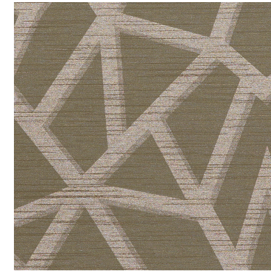
Click for DN2-DHA-04

» CLICK FOR: » QUOTES » STOCK CHECK » SOURCEBOOK