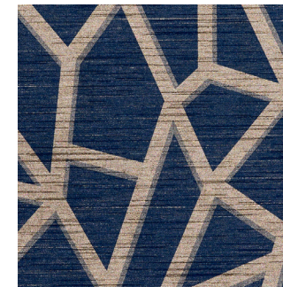
Click for DN2-DHA-08