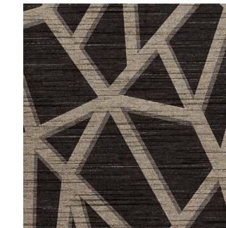
Click for DN2-DHA-10