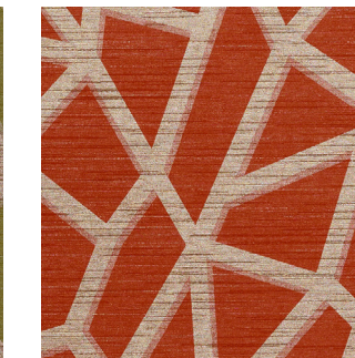
Click for DN2-DHA-16