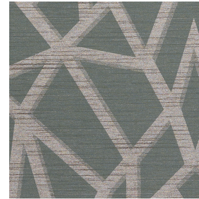
Click for DN2-DHA-05