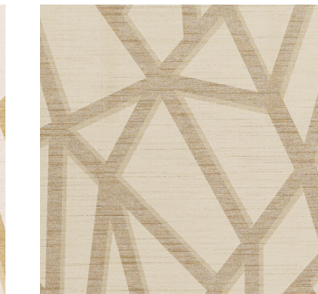
Click for DN2-DHA-12