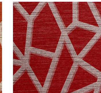
Click for DN2-DHA-17