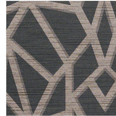
Click for DN2-DHA-06