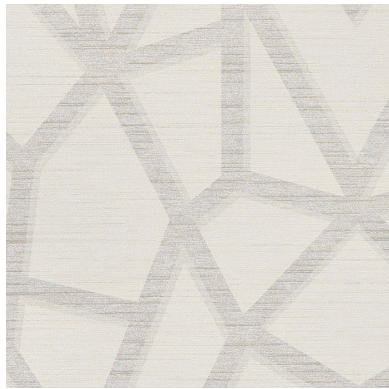
Click for DN2-DHA-01