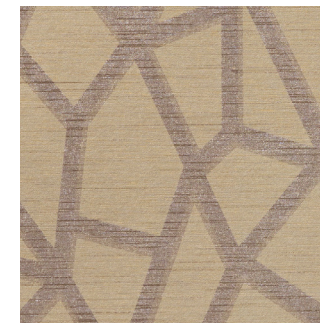
Click for DN2-DHA-13