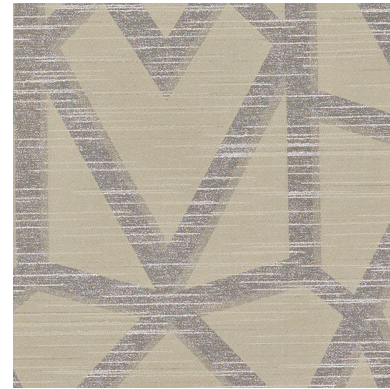
Click for DN2-DHA-03