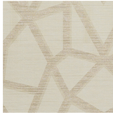
Click for DN2-DHA-02