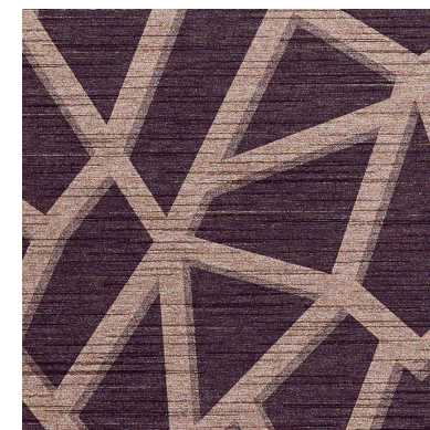
Click for DN2-DHA-18