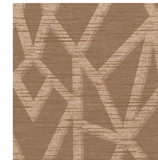
Click for DN2-DHA-14