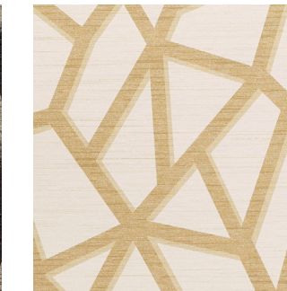
Click for DN2-DHA-11