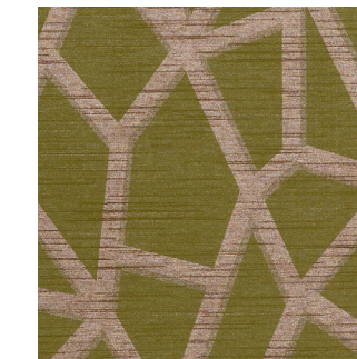
Click for DN2-DHA-15