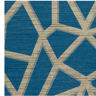
Click for DN2-DHA-07