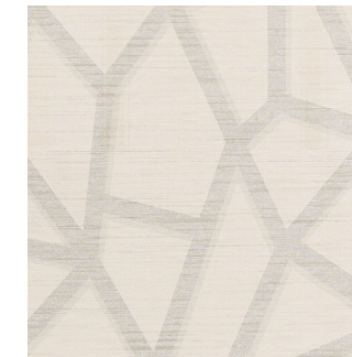
Click for DN2-DHA-09