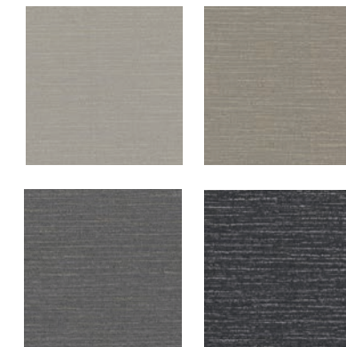
DN2-BAR-15 through 18